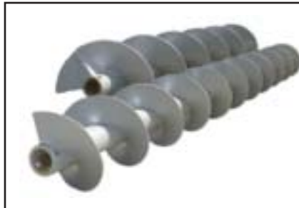
Martin Screw Conveyor