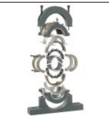
Cooper Split Bearings