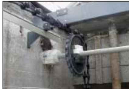
Hitachi chain and Accessories