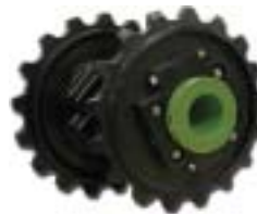
Drive / Idler Sprockets