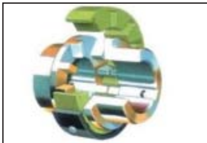
Falk Wrapflex Couplings