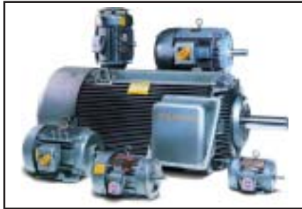
Baldor Electric Motors Extreme Duty

BDI is committed to supporting your operations with local inventories specific to the Wastewater Treatment industry. Each BDI location has technical resources available for on-site troubleshooting and equipment upgrade recommendations.