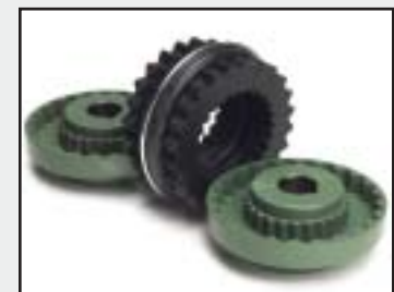
TB Woods Sure-Flex Couplings