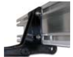
Chain & Flights