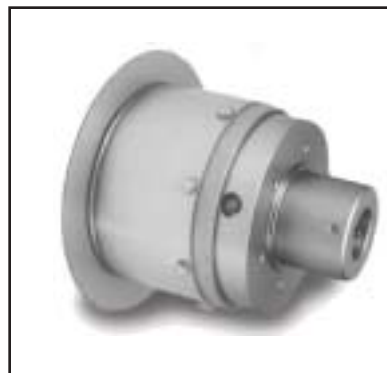
Boston Gear Overload Clutch