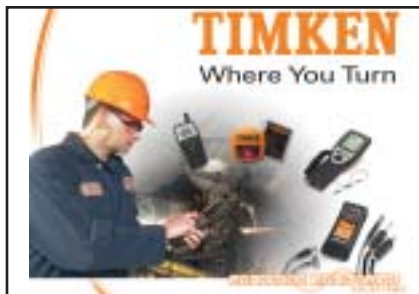
Timken Condition Monitoring