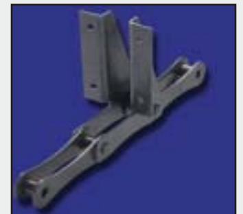
Hitachi SAV 709 SS Chain