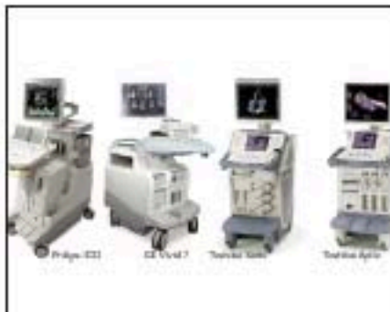
CARDIAC IMAGING Casters and ...

Your local BDI representative is trained and knowledgeable on the products and services offered. You can count on BDI for information and updates on new products and innovations that positively impact your operations.