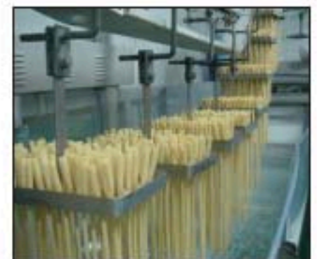
CONVEYOR SYSTEMS & COMPONENTS Chain & Drive Systems